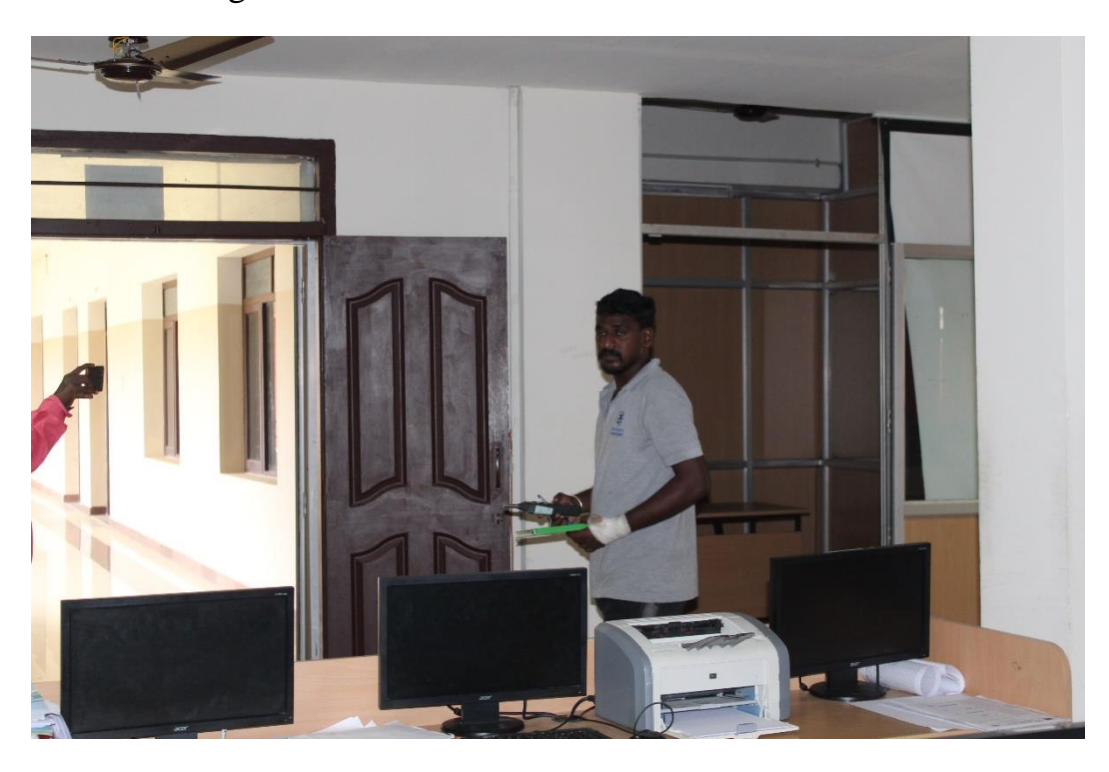
Lux and noise monitoring