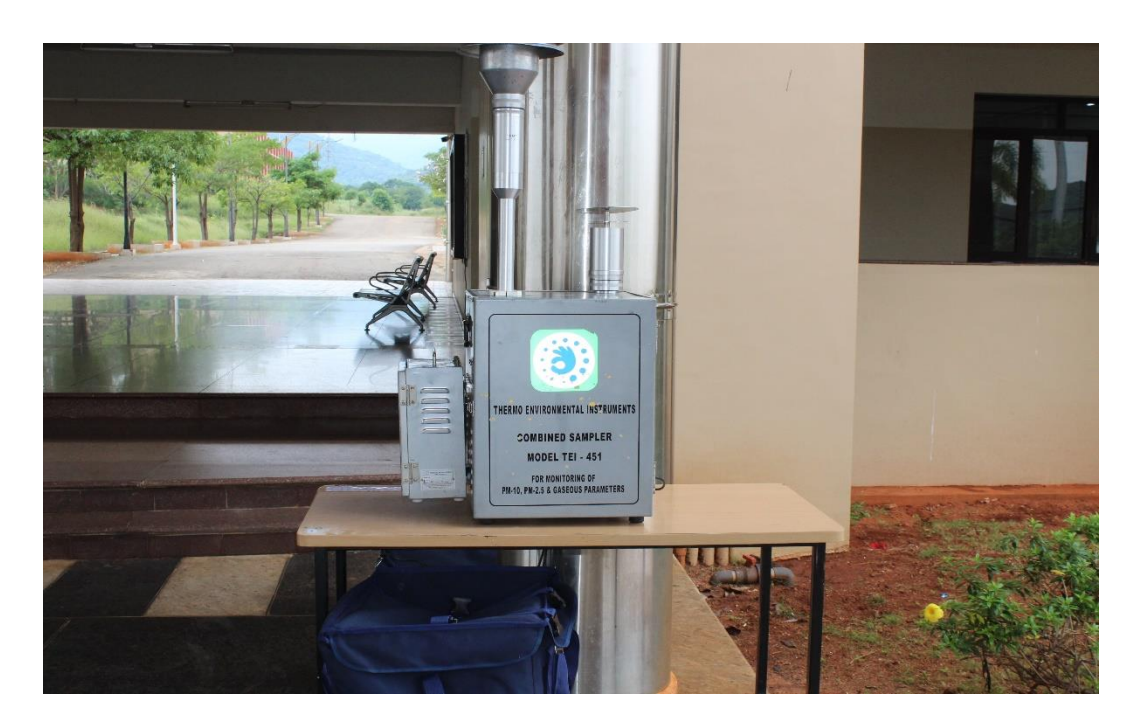
Air Quality monitoring

Ambient air quality monitoring can help in providing a strategic solution towards air purification and help lead a safer life. Also, air quality monitoring in the school campus not only develops trust among the parents but ensures that the administration cares about their Students and Staff