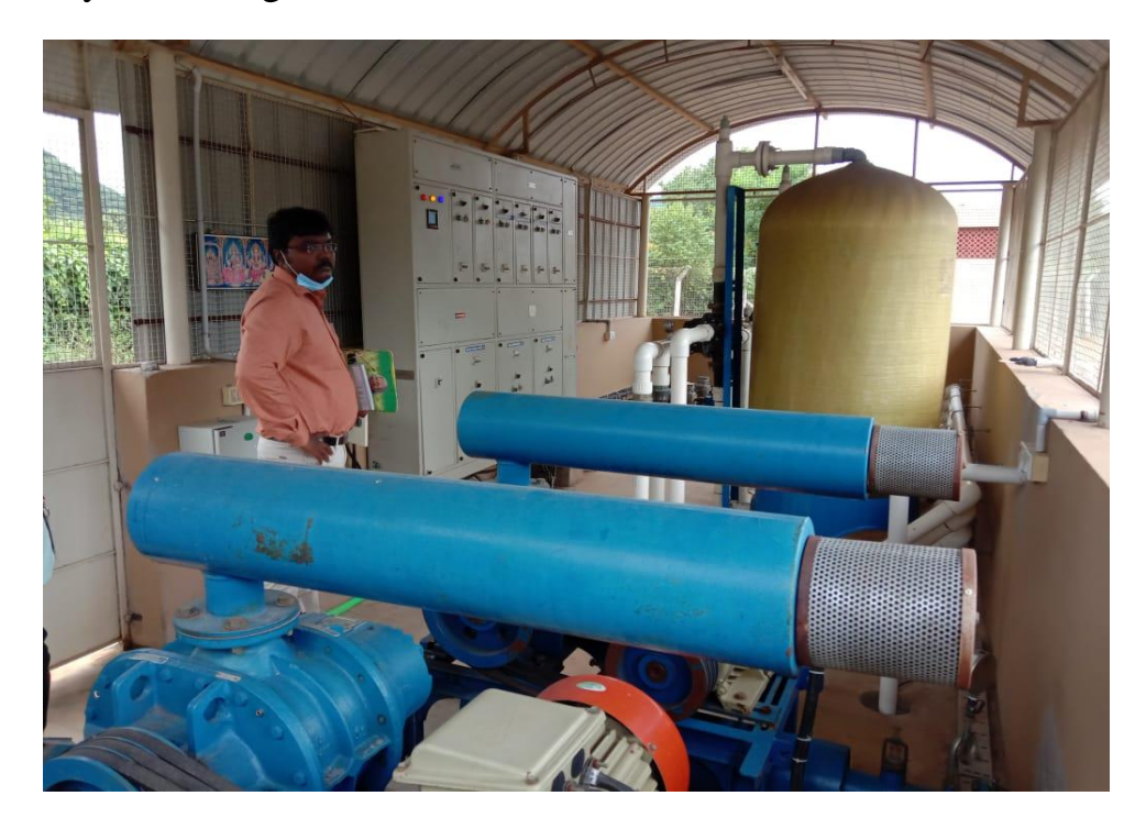
Water recycling plant

Liquid waste management : A mini water treatment plant is available within the campus. The waste water from domestic usage (grey water) is recycled and used for gardening. This is one of the greening initiatives taken by the management.