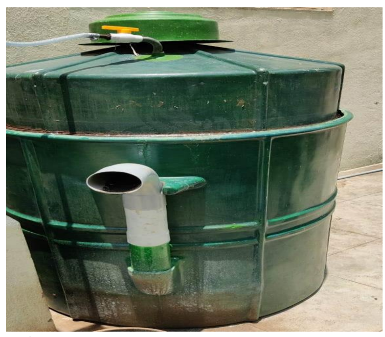
1m³ Capacity Bio gas Plant Installed In College Campus