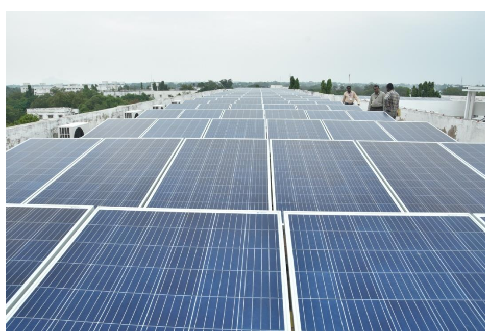
Solar panels in the campus

Equipment like Computers is used in power saving mode. The campus administration runs switch –off drill on regular basis. Electricity was shut downed after occupancy time in all the classrooms and laboratories as one of green practices for energy conservation.