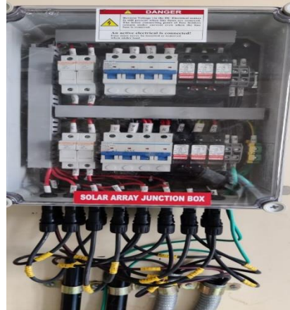
Solar panel Control Unit