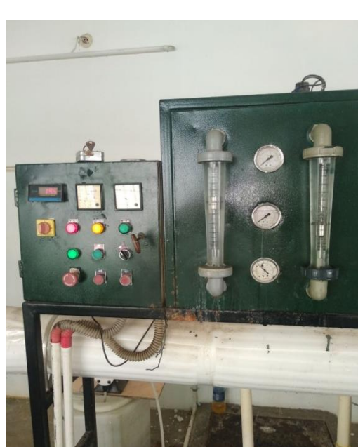
Reverse osmosis plant