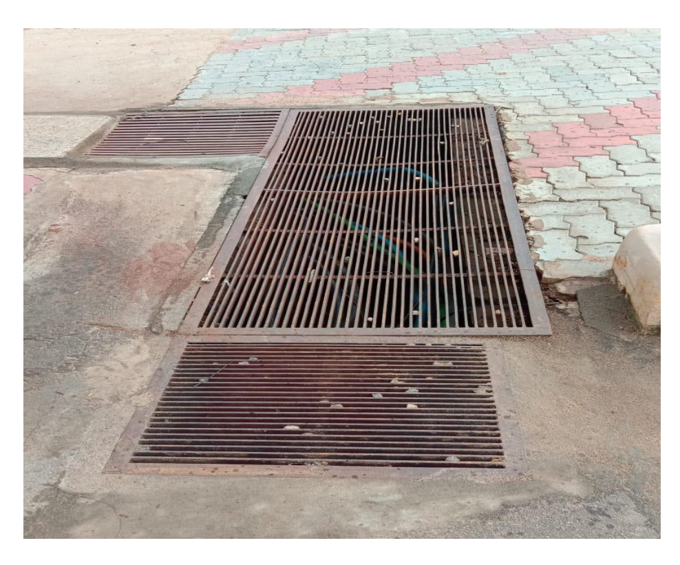
Rainwater harvesting system

Also, 11 soak pits in the size of 45 inches x 55 inches are available to harvest the rain water.